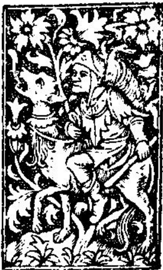
Figure 1 Huntsman from Horae, Paris (Pigouchet for Vostre) 1496/97

Copyright 2013, Shire of Crimson River. All rights revert to authors and artists. This is not a corporate publication of the Society for Creative Anachronism, Inc. and does not delineate SCA policies.